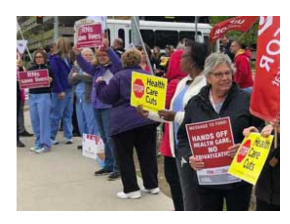
B.C. Supreme Court dismisses constitutional challenge by a private health clinic attempting to make for profit, private health care legal.