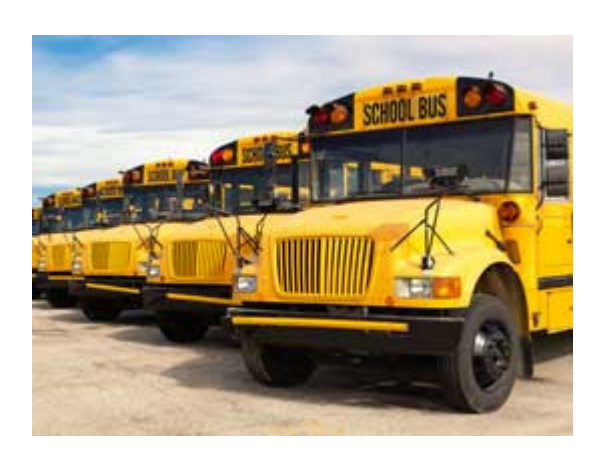
As students return to school Ontario school bus driver members call on the Ford government to take immediate action to address COVID-19 safety concerns.