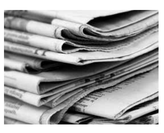
Unifor calls on new Torstar owners to halt the elimination of 24 Hamilton Spectator jobs as the union plans to bring forth a proposal to keep media jobs in Canada.