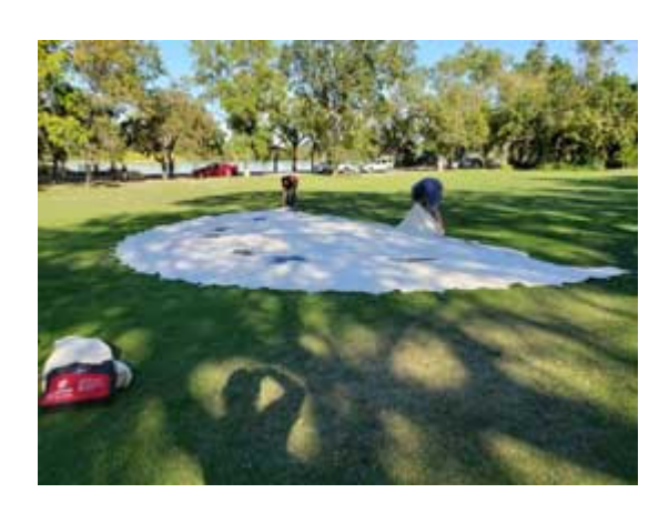
Unifor Local 1-S members organize Indigenous instruction outside Saskatchewan's legislature.